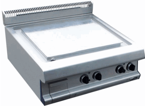
PLATE 620X515 TOP ONLY